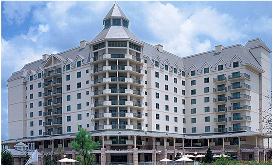
EFCO Series SX45 Horizontal Slider

This Environmental Product Declaration (EPD) was prepared in accordance with ISO 14025 and 21930 using the Earthsure Cradle to Gate Window Product Category Rule 30171600-2015. EPDs are not intended to make comparisons with other products due to varying background data in LCA softwares and/or varying program operator rules or Product Category Rules. An EPD is informational and does not warrant performance. Valid 22 May 2017 through 21 May 2022.