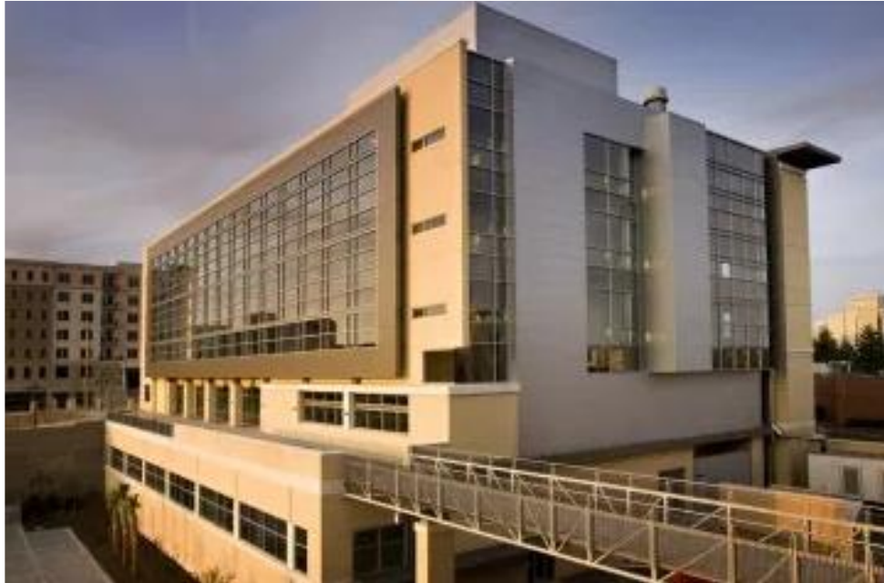
EFCO Unitized Curtain Wall System 5600PG

This Environmental Product Declaration (EPD) was prepared in accordance with ISO 14025 and 21930 using the Earthsure Cradle to Gate Window Product Category Rule 30171600-2015. EPDs are not intended to make comparisons with other products due to varying background data in LCA softwares and/or varying program operator rules or Product Category Rules. An EPD is informational and does not warrant performance. Valid 22 May 2017 through 21 May 2022.