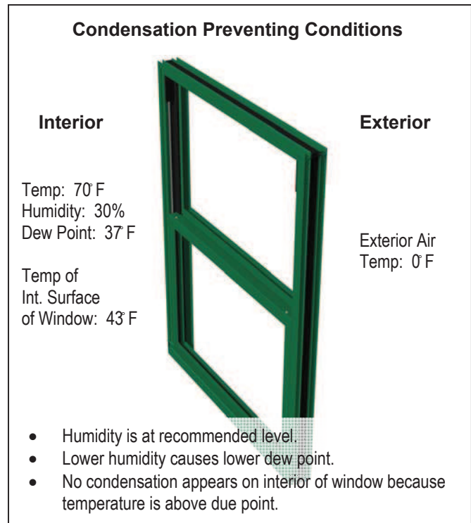
Maximum Recommended humidity Levels